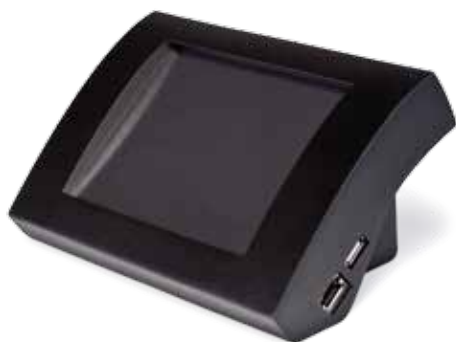
▶ Portable and versatile user interface HID-Pro 320 with a 5.7" touchscreen, USB and LAN port

The new portable HID-Pro 320 user interface eliminates the need for a PC and makes the system exceptionally easy to operate. Its extra large 5.7" color touchscreen eliminates the need for a keyboard or mouse. The software, which is based on Windows CE, offers typical Windows functions and operating environment, as well as an intuitive menu bar.