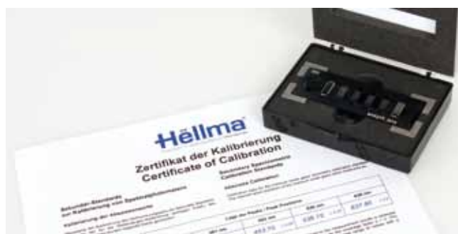
▶ Validation CHIPCUVETTE® external certified by Hellma

The validation of VIS photometry is done with the aid of the neutral glass filters NG1, NG4, NG3 and NG9. A holmium oxide glass filter is also used for checking wavelength accuracy. WG280 glass is necessary as reference filter.